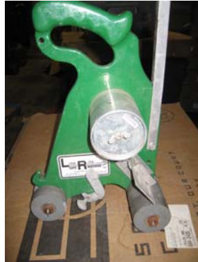
Line-Rite Line Taping Machine

If you use this method, check that the paint doesn't drip onto the court surface below and act as glue, securing the tile to a particular spot on the court. If this happens, break the bond between the tile and the surface beneath.